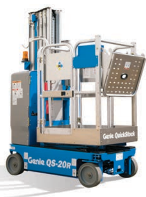
Stock Picker<sup>™</sup> Platform 89 x 73 cm (35 x 28.5 in) Offers dual side entry gates and front-folding tray.