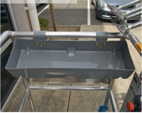
Work Station Tray (not available on narrow or ultra-narrow platforms)