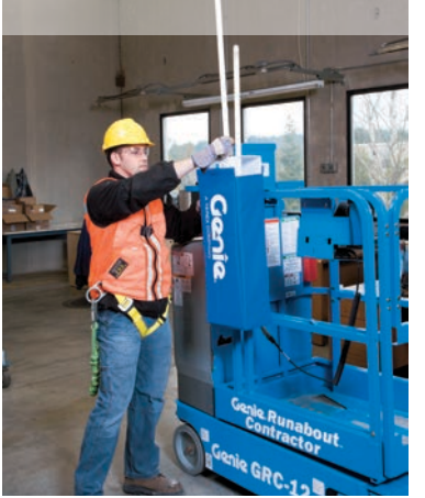
Fluorescent Tube Caddy (only available on narrow or standard platform)