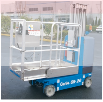
Sliding Mid Rail Extension Deck Platform 140 x 75 cm (55 x 29.5 in) Provides 51 cm (20 in) of horizontal outreach and a larger work area