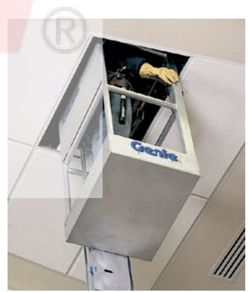
The narrow platform option is perfect for accessing the space above ceiling tiles.

* Fiberglass platforms do not provide protection from electric shock.