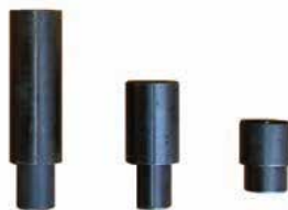
1½" - 3" - 6" Height Adapters 4T2P9A136