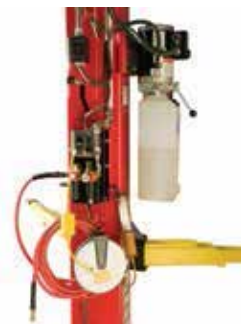
Air - Electric Station 4T2AES