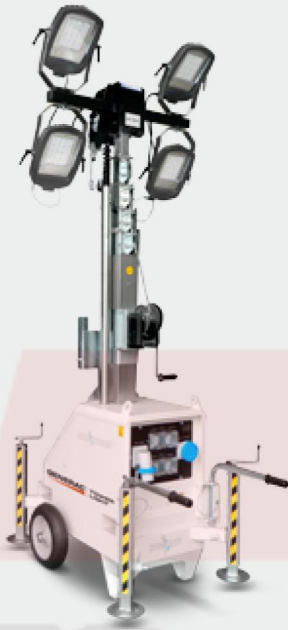
Linktower 4x150W LED