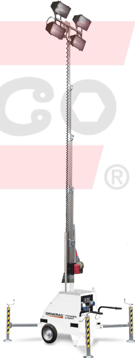
Linktower 4x400W MH