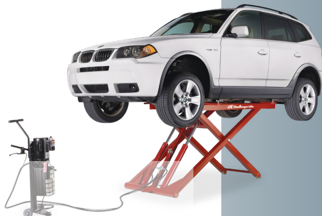
Model#: MR6 Portable Mid-Rise Lift 6,000 lb. capacity

Exclusive features include a sliding/rotating arm design with rubber pads, low drive-over clearance, and much more.