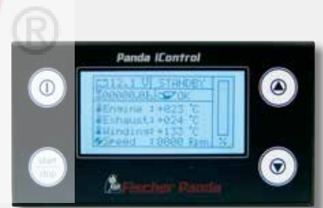
Panda iControl digital display

مركز البراغي والعدد BOLTS & TOOLS CENTER BTGO