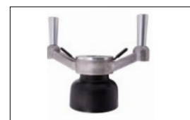
Premium Quick Nut