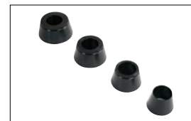
Tweener Cone Kit