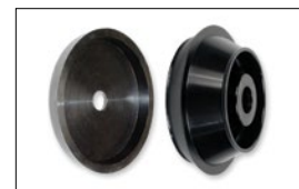
Light Truck Cone Kit