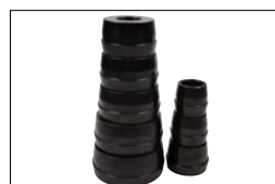
Double Sided Collets