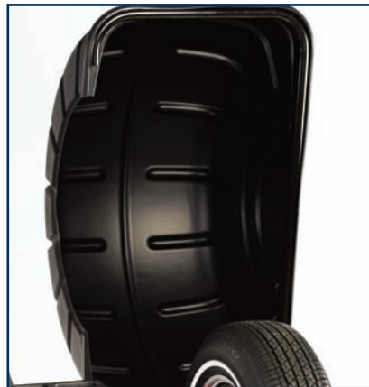
Auto Start Hood