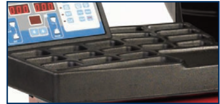
17-Pocket Weight Tray