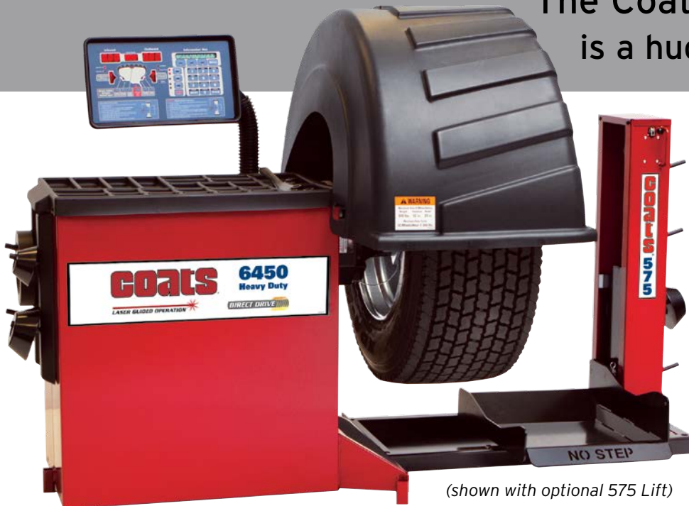
(shown with optional 575 Lift)

The Coats 6450 Series is a huge step forward.