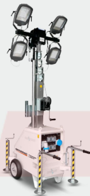
Linktower 4x150W LED