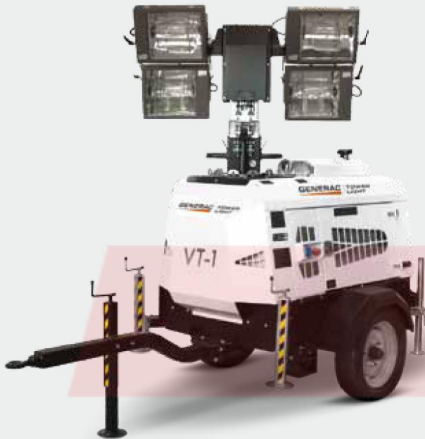
VT1 4x1000W MH