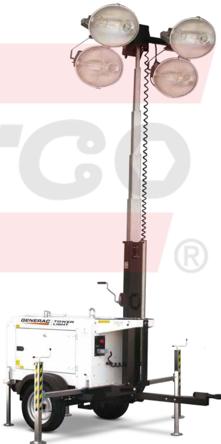
VT7 4x1000W MH