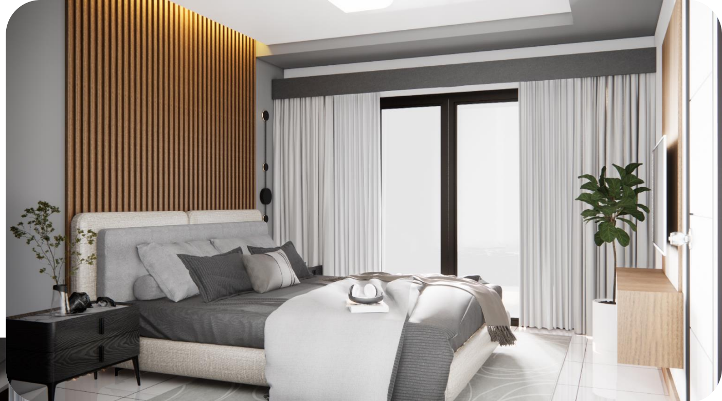
Baril Interior Perspective