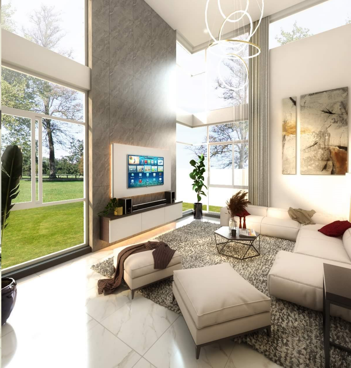
Velasquez Interior Perspective