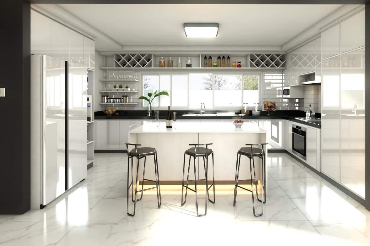
Velasquez Interior Perspective