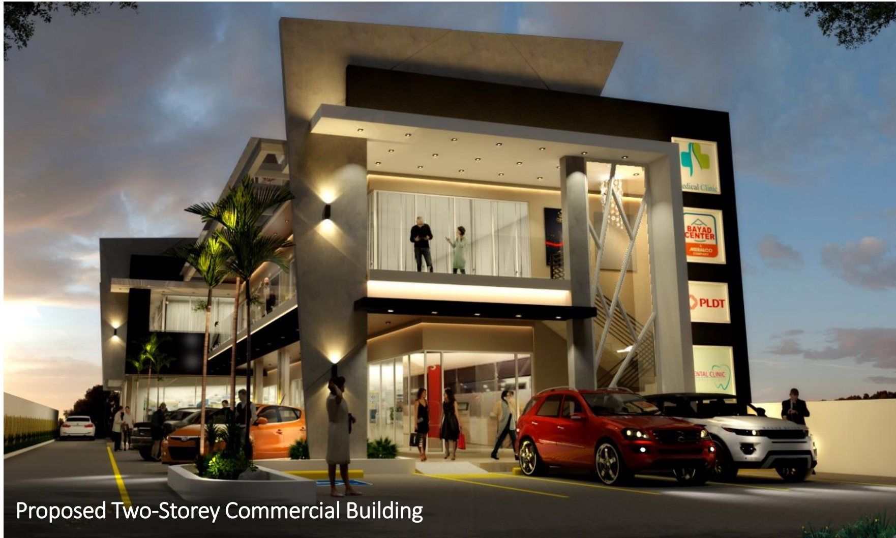
Proposed Two-Storey Commercial Building