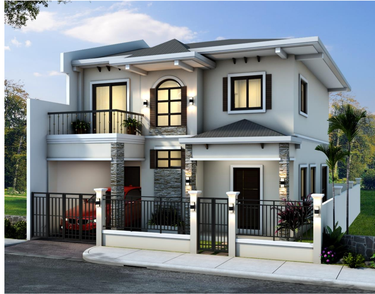
Proposed Two-Storey Residential Structure