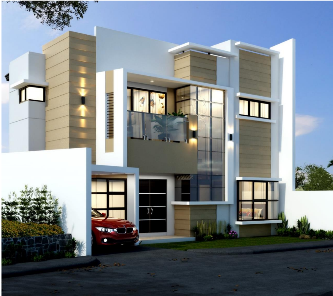
Proposed Two-Storey Residential Structure