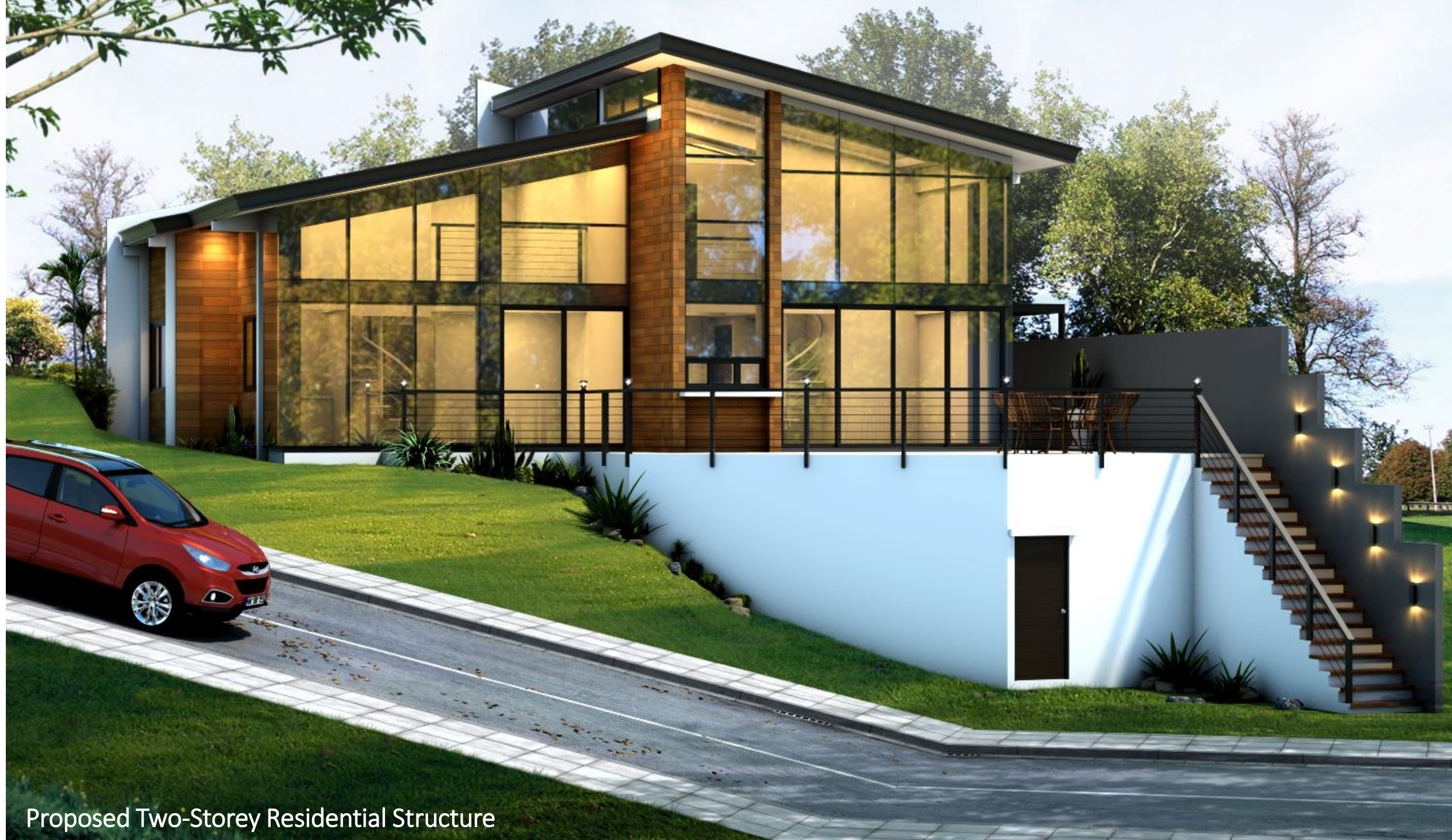
Proposed Two-Storey Residential Structure