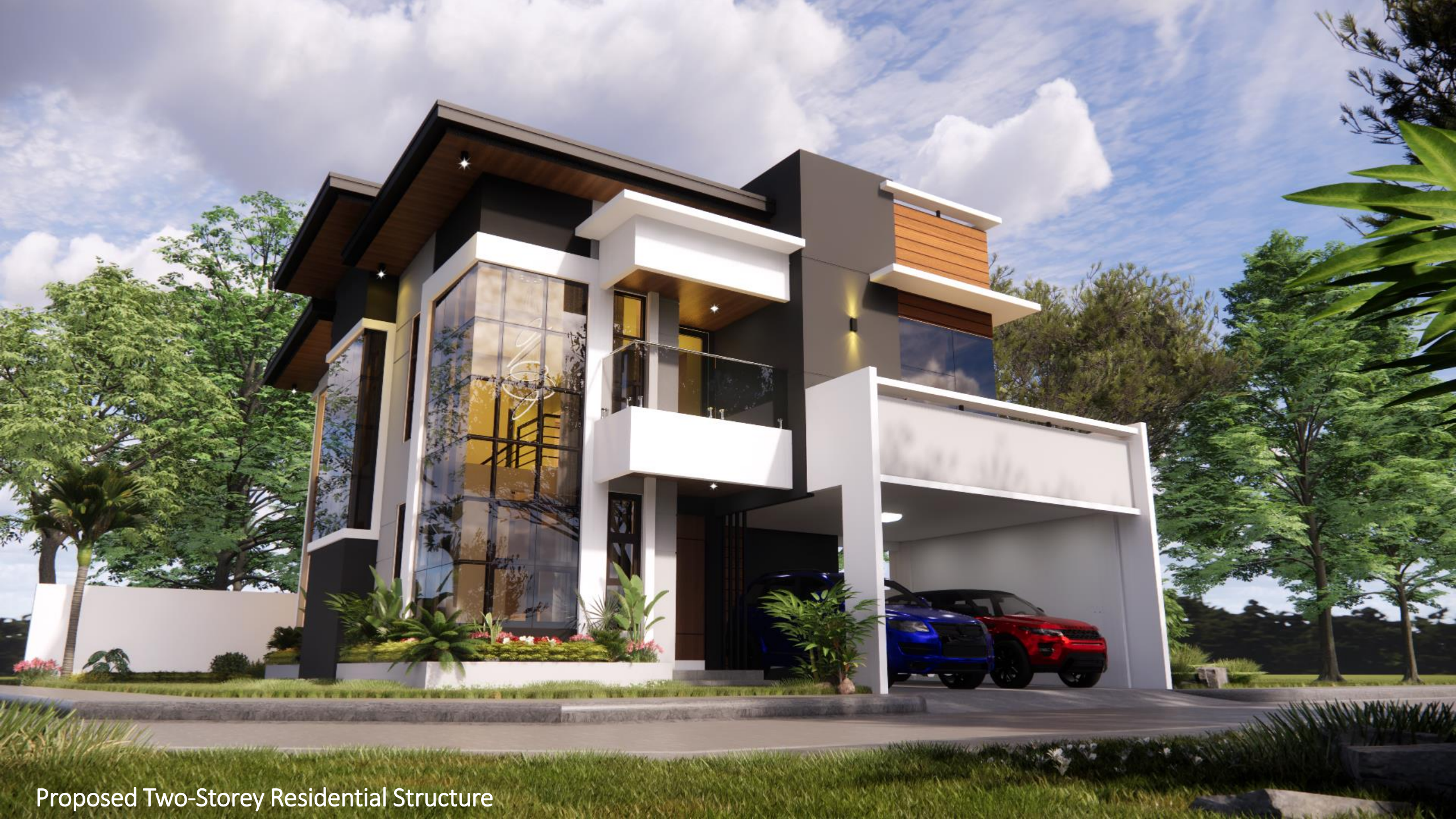
Proposed Two-Storey Residential Structure