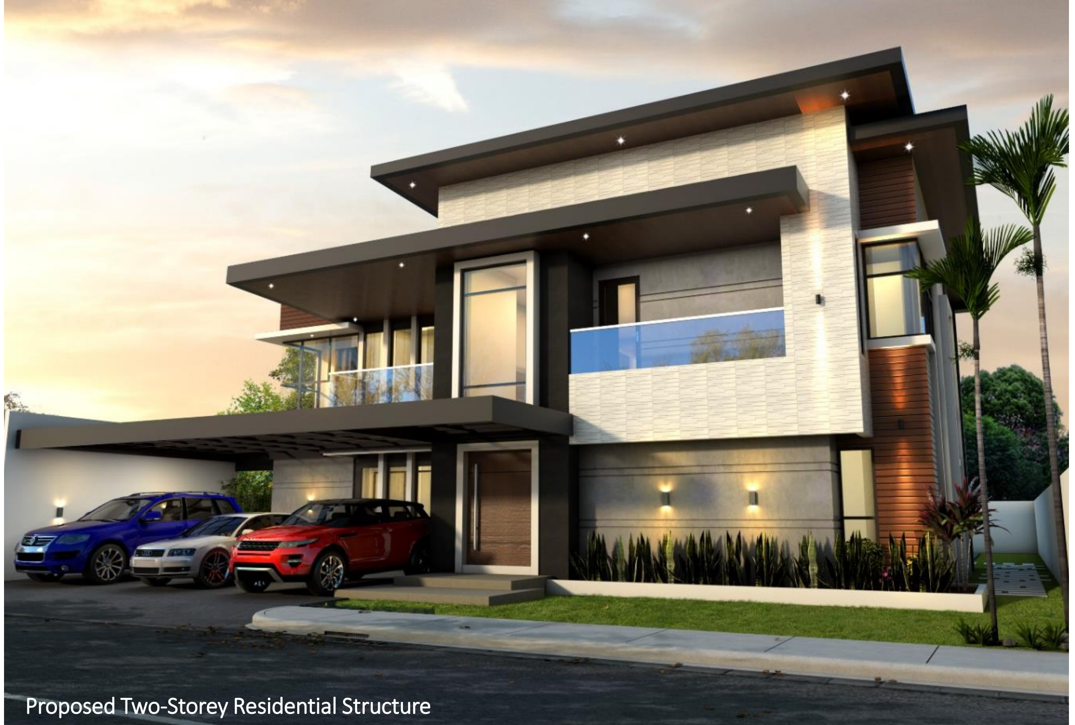
Proposed Two-Storey Residential Structure