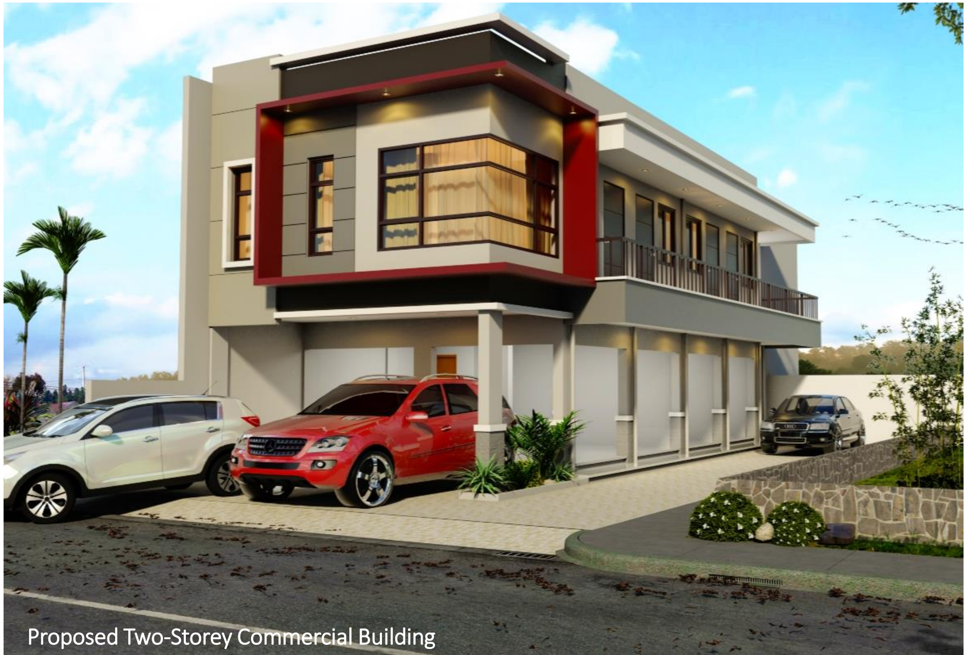
Proposed Two-Storey Commercial Building