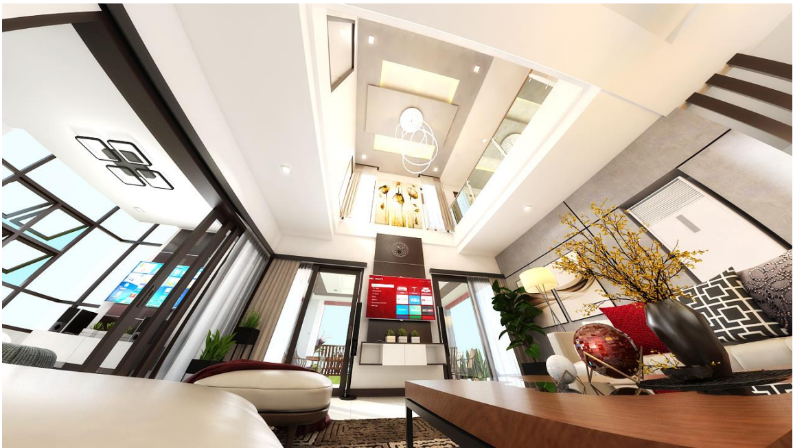
Cabral Interior Perspective