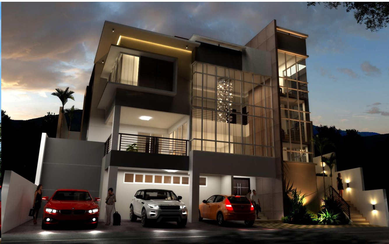
Proposed Three-Storey Residential Structure