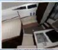
TOP GALLEY VIEW