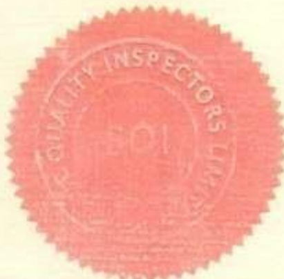
GENERAL MANAGER MAISHA MABATI MILLS LTD

TECHNICAL DIRECTOR SONIC QUALITY INSPECTORS LTD