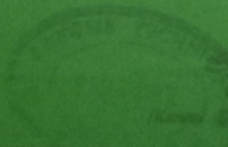
Head of Centre (Karume Technical Driving Centre)

NOTE: THIS CERTIFICATE DO NOT AUTHORISE DRIVING WITHOUT LICENSE