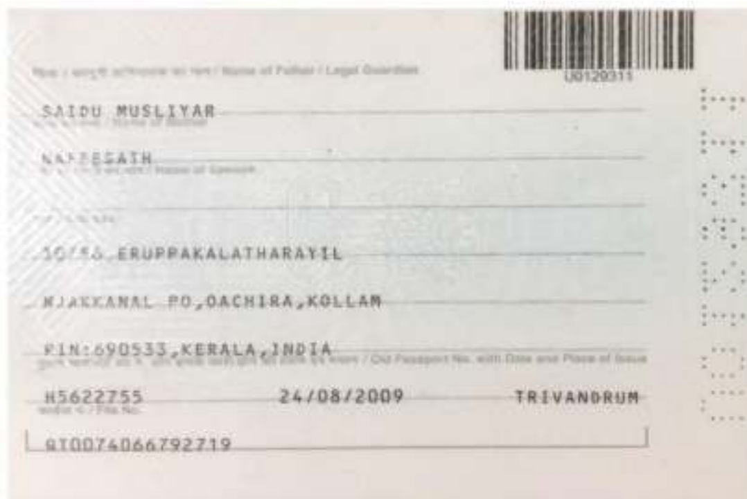
PhotoScan by Google Photos