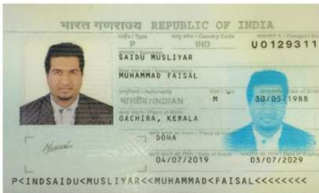
PhotoScan by Google Photos