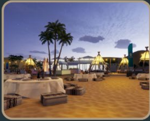
02. exterior renders