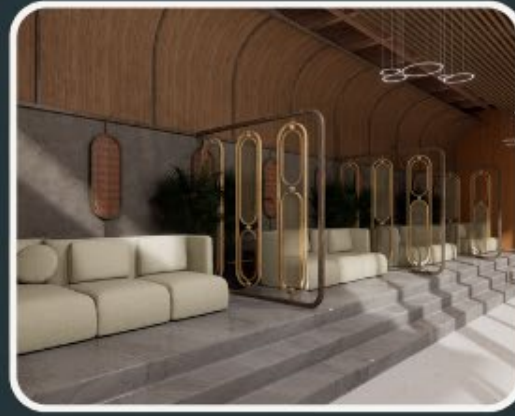
03. interior renders